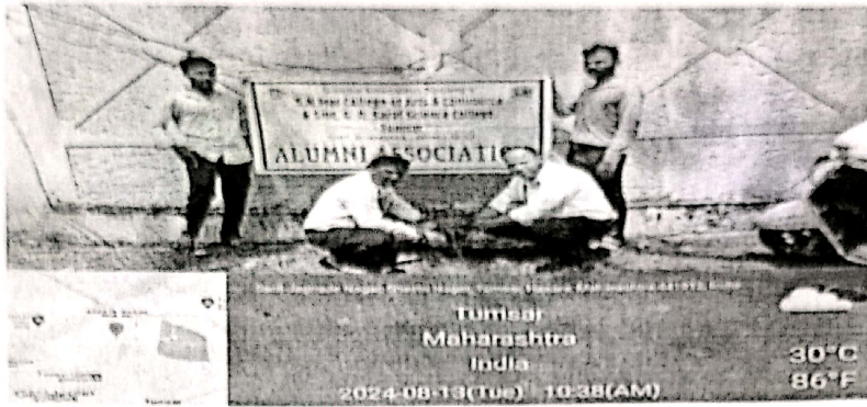
Tree Plantation by College Alumni Association