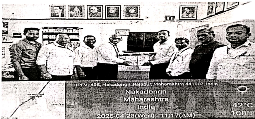
Distribution of educational material