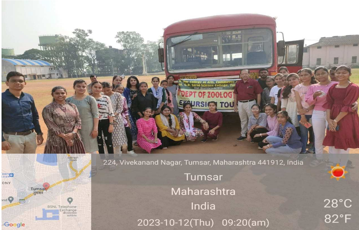
Teachers and students ready to go for study tour Daudipar (Khapa), and Rawanwadi