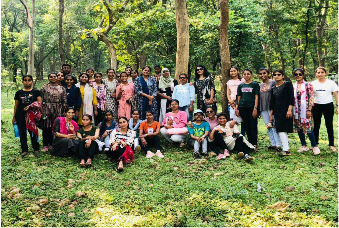
Group photo of B.Sc Semester V students with teachers in Rawanwadi