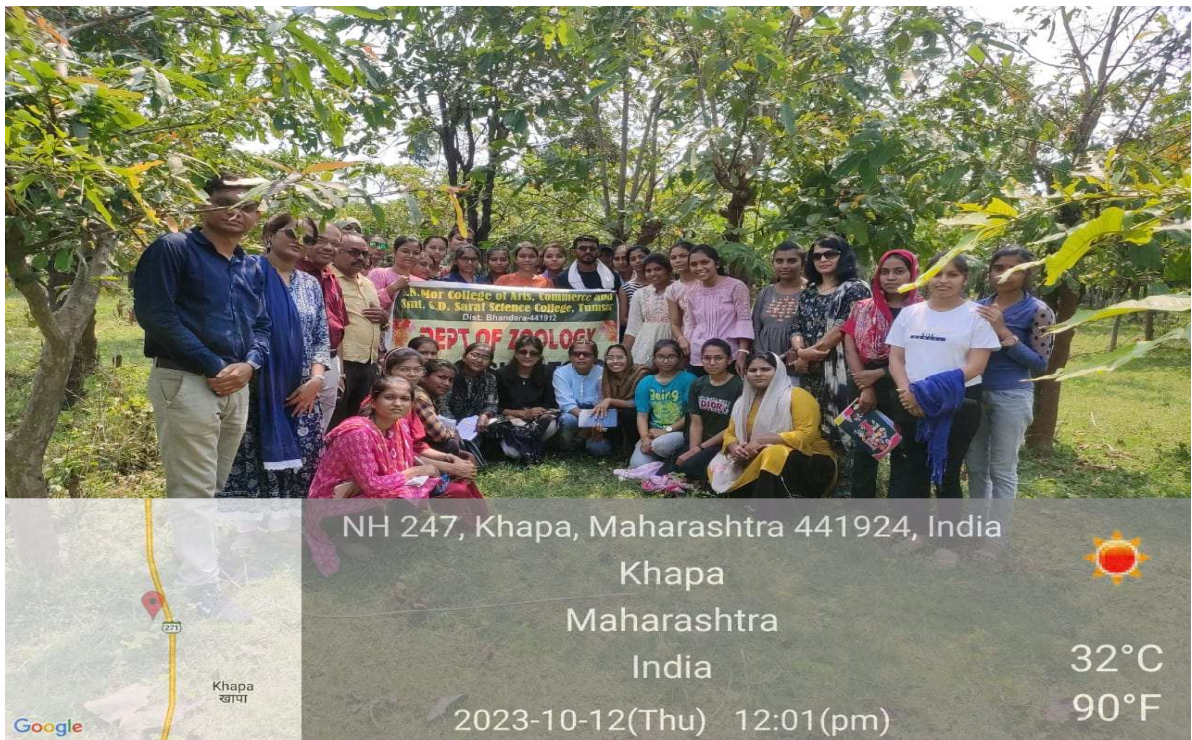
Group photo in forest of Central Tasar Silk Board, Daudipar