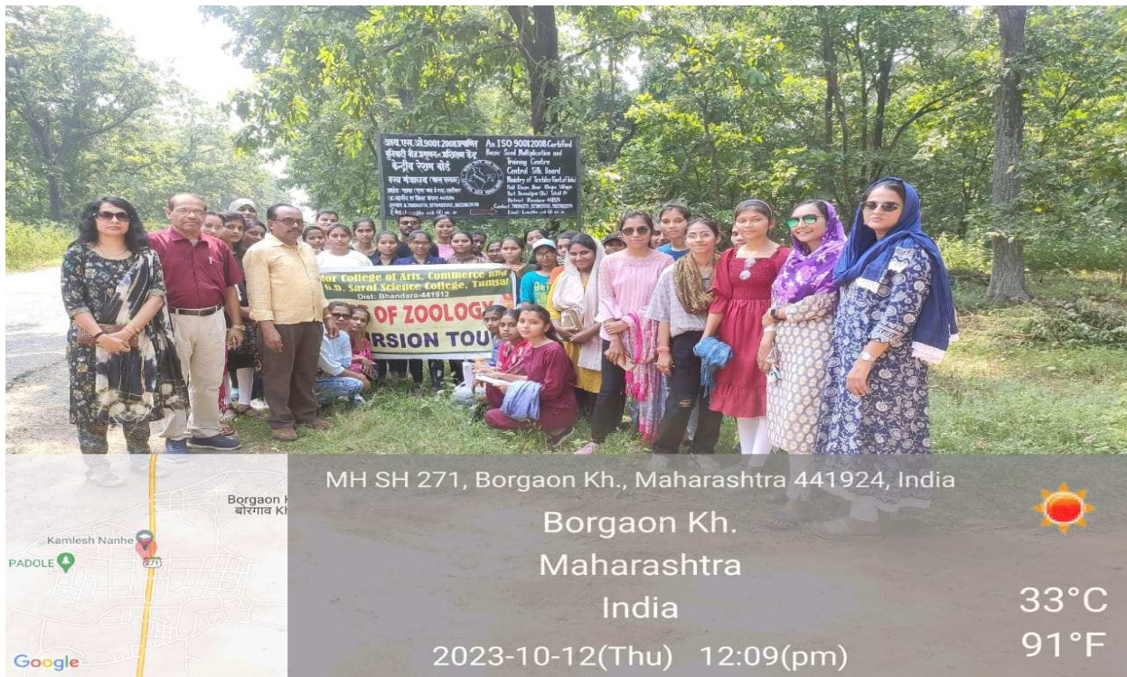
Group photo of B.Sc Sem V students in Central Tasar Silk Board, Daudipar (Khapa),