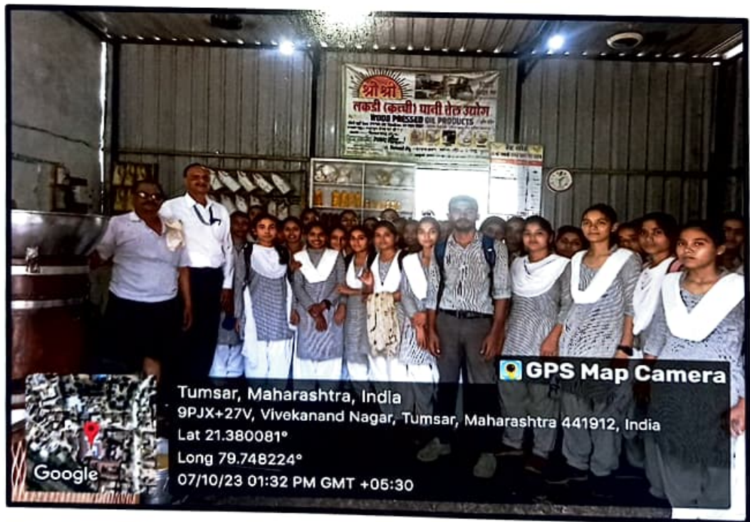
B.Sc. Semester V th Students visit at Shri Shri Kachhi Ghani oil extraction Unit, Tumsar